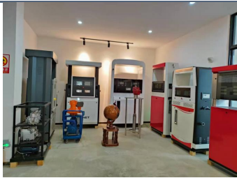
CHANGCHAI high power engine