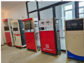
Japan Shimadzu hydraulic motor