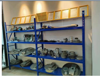
Imported EATON control valve