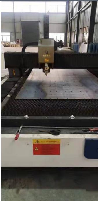
Project in Thailand